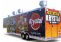
Mobile Kitchen Trailer Go on site with a mobile marketing trailer