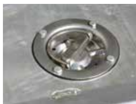
D ring tie downs