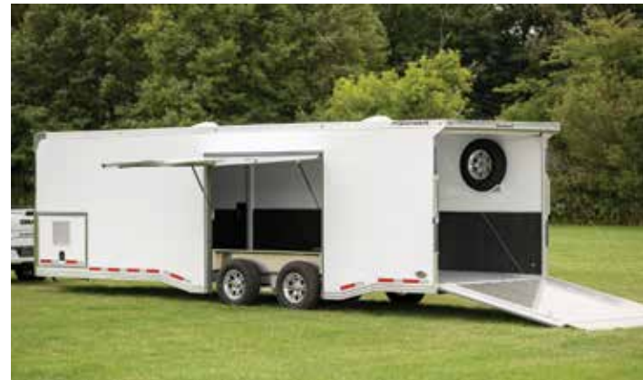
Premium escape door on 4410