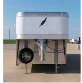
Gooseneck tapered nose