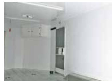
White lined & insulated interior

Note: All dimensions are approximate. Some trailers may be shown with options.