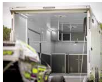
Wide array of cabinet options