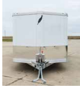
Bumper pull aerodyne nose

Features may vary depending on trailer model. Some options shown are not available on all models.