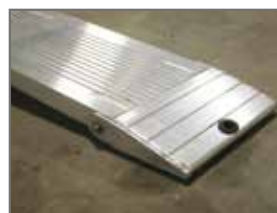
Flex Foot ramps