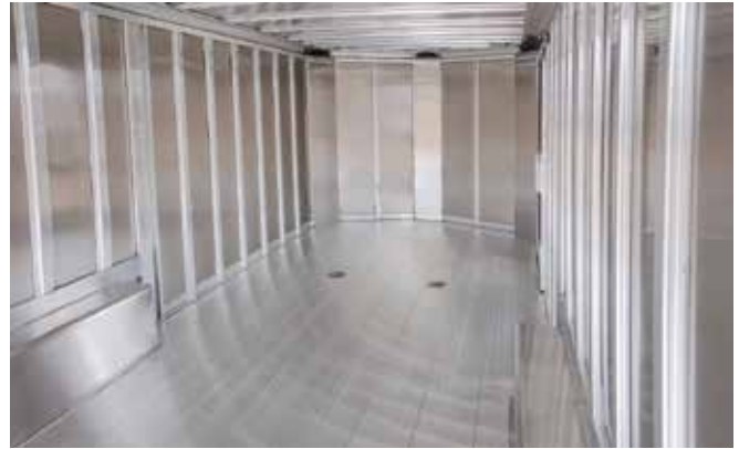
All aluminum construction