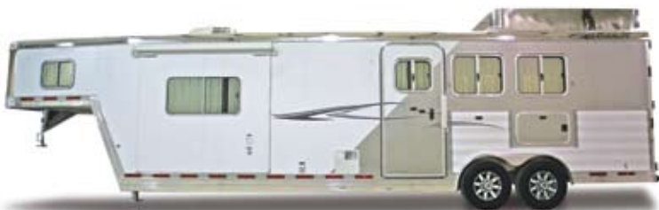
Model 8581. Featherlite's fabulous living quarters model is available with lots of floorplans and with 2 to 6 horse stalls. Trailer is fully customizable. Horse area features standard white aluminum lining for brighter interior. See Living Quarters photos on back page. Shown with many options.