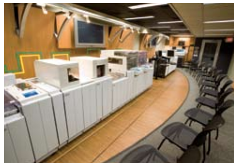
Interactive. Interactive interiors are our specialty.