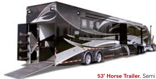
53' Horse Trailer. Semi horse trailer that is fully customizable and available with or without living quarters.