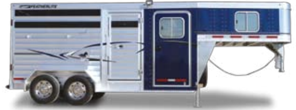
Model 8417. The gooseneck combo trailer measures an easy-to-tow 6'7" wide, is available in lengths of 16', 20', 22' and 24', and includes a slant or straight wall dressing room. The trailer comes standard with a wood floor, escape door and full swing rear gate. Shown with options including blue side sheets, graphics, load light and plexiglass.