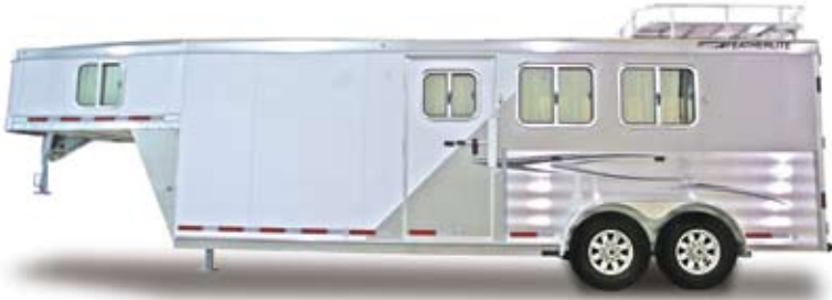
Model 8533. Gooseneck trailer is available as a 2, 3, 4 or 5-horse trailer with dressing room options of 46", 74", 96" and 124". Also available with living quarters or mid tack. Shown with optional dual sides, graphics, hay rack and aluminum wheels.