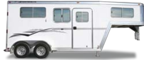
Model 9607. Straight load Model 9607 features mangers with walk through door and a dressing room.