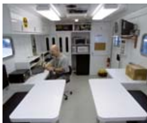
Emergency Response. Gives you the edge when disaster strikes.