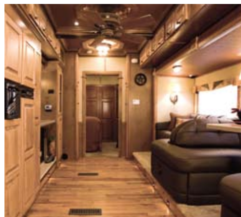
Country Estate. 53 ft. horse trailer with 33 ft. LQ and four slideouts.