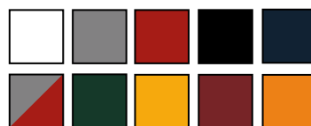
Side sheet color options. White standard. Silver, Red, Black, Blue, Green, Yellow, Brandywine and Orange optional. Dual and tri-color also optional.