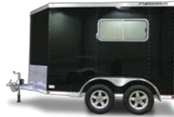
Model 9401. 2-horse trailer features movable divider or wall with slam latch to go between slant load and straight load. Add optional ramp for easy loading of other cargo. Measures 6'7" wide, 10' long and 7' tall. Shown with optional black sides and aluminum wheels.