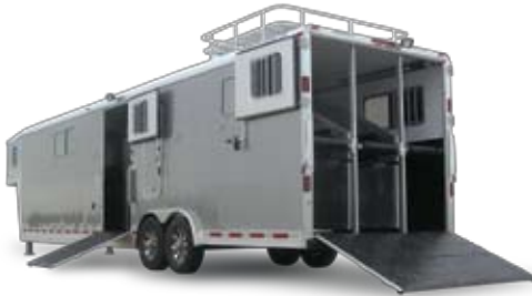
Model 9810. Model 9810 is a straight load 6-horse. It features a tack room and ramps on both sides of the trailer. Shown with many options including hay rack and silver side sheets.