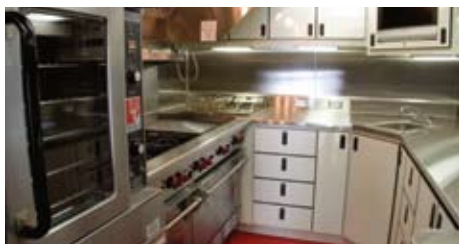
Kitchen. Custom kitchen areas in restaurant and vending trailers