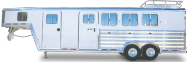
Model 8541. This slant load can be customized to hold 2 to 6 horses and with about any dressing room size. Model 8541 comes standard with white aluminum lining in the horse area and is available with width of 7' or 7'6". Also available with living quarters. Shown with optional hay rack and polished panels. Looking for extra value? Ask about new 8541-L!