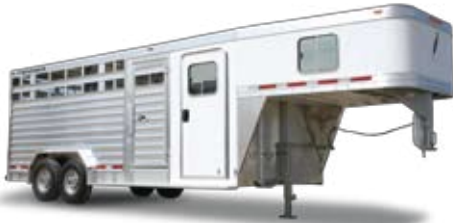
Model 8414. Versatile combo trailer 8414 is a standard 7'6" wide with lengths of 16', 20', 24' and 28'. It features a full swing rear door with lockable slider for loading and is available with either a straight or slant dressing room wall. Choose Model 8415 for 8' width. For horses, cattle or other livestock.