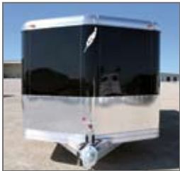
Bumper pull aerodyne nose