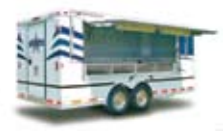
Vending Trailer Food or merchandise sales

Featherlite supports racing Featherlite is proud to sponsor these organizations and events (among many others)