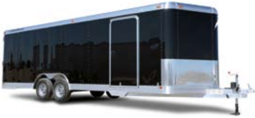
A gravel guard is standard on Model 4926 for extra protection of your trailer from rocks and debris.