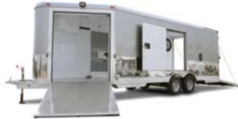
Model 4926 shown with optional silver sides, front ramp, raised deck, stainless steel wrap, cabinets, side access door, spare tire and more.