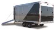
Model 1648 bumper pull snowmobile hauler