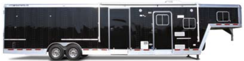
Model 4926 and 4941 shown with a living quarters. Choose from many floorplan and décor options to customize your car hauler.