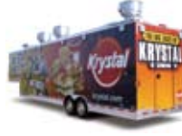
Mobile Kitchen Trailer Go on site with a mobile marketing trailer