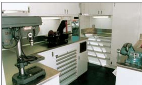
Cabinets and workbenches available for storage and work space.