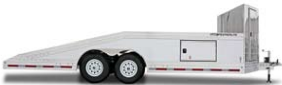
The 20' version of Model 3110 is now available as a one car wedge trailer. The bed has a gradual slope allowing for wider vehicles, like modified race cars or dually trucks, to be hauled.