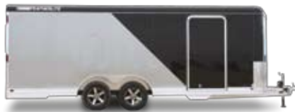
Shown with optional dual color.

Snap this with your smart phone to see a walkaround tour of Model 4926.