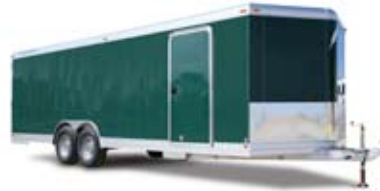
Shown with optional green color.