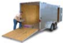
Model 1610 Rec/utility trailer to haul all types of cargo

For more information on the Featherlite Full Line of Trailers, visit www.fthr.com