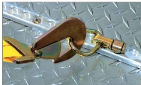
Various options are available for securing your cargo including airliner track or aluminum a-track.