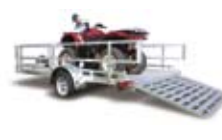
Model 1693 Versatile open rec trailer