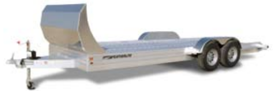
Provide your cargo with extra protection with an optional aluminum air dam on Model 3110.