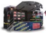
Mobile Display Trailer Take products to your customers