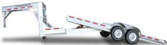
Power lift package is an option on selected lengths of open car haulers Models 3110 and 3112.