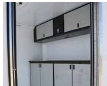
Wide array of cabinet options