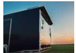
Rivetless side sheets on 4410

WANT MORE INFORMATION? GO TO WWW.FTHR.COM