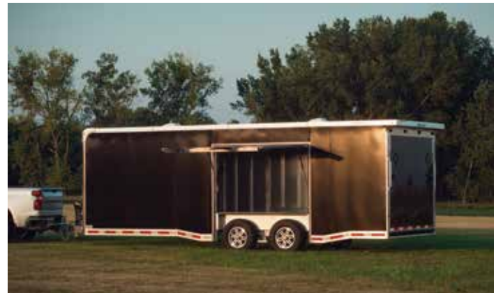
Premium escape door on 4410