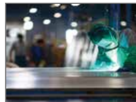
Quality & durable aluminum construction