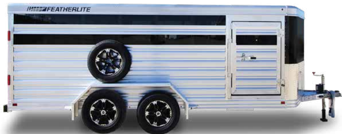
16' low profile with options such as plexiglass, black aluminum wheels, spare tire, rear ramp and more.