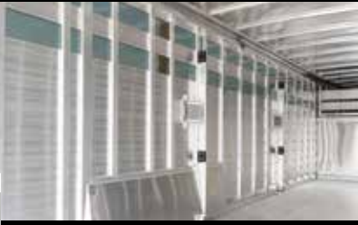
Side panels with smooth interior wall