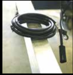
Wiring harness keeps wiring secure