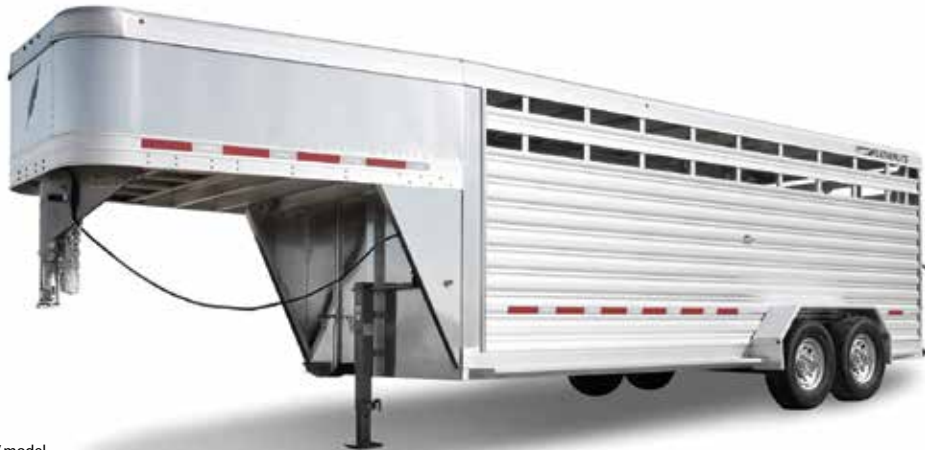
Shown: 20' model.