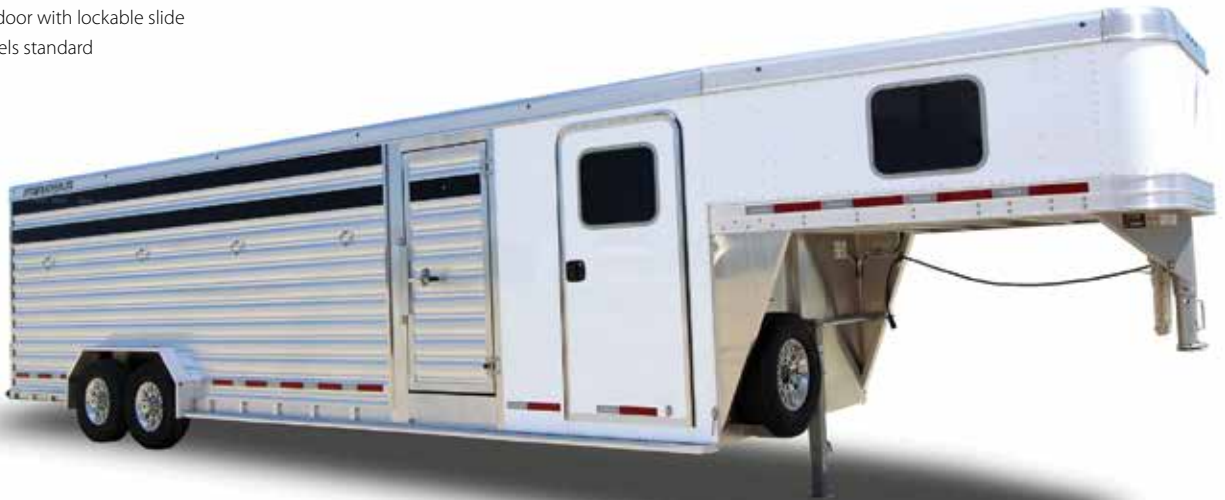
Shown: 28' model with plexiglass.

Dimensions shown are approximate and may vary.