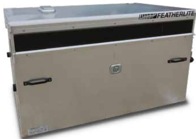
Shown: 6' model.