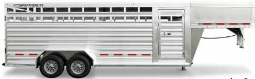
Shown: 20' model.