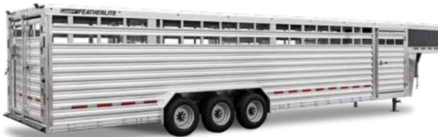
Shown: 34' model with 54" escape door, black sides sheets and more.