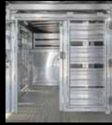
Optional Step Safe gates protect livestock