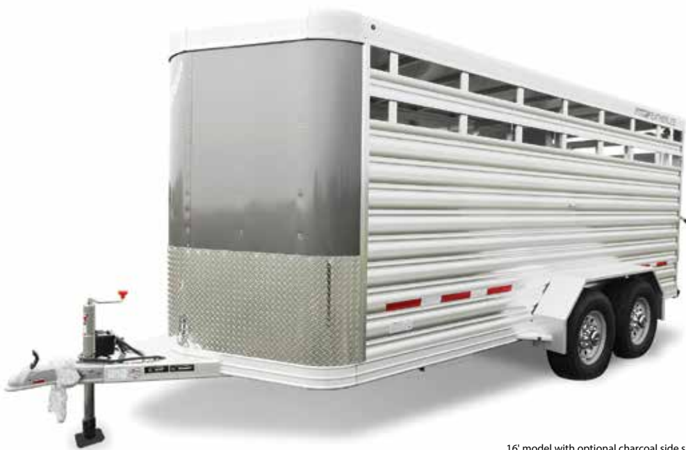
16' model with optional charcoal side sheets.