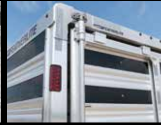
Heavy-duty rear hardware