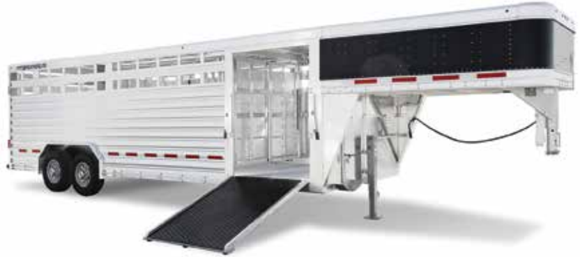
Shown: 24' model with optional black side sheets and side ramp.