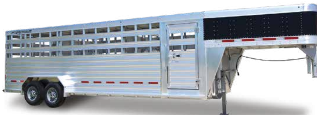
Three top air spaces are optional on your stock trailer.