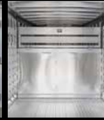
Brawny drop gate standard