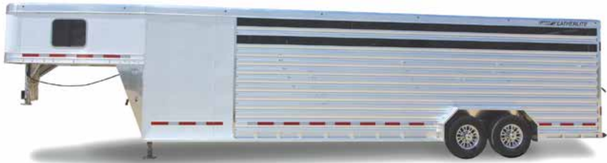
Shown: 28' model with plexiglass.