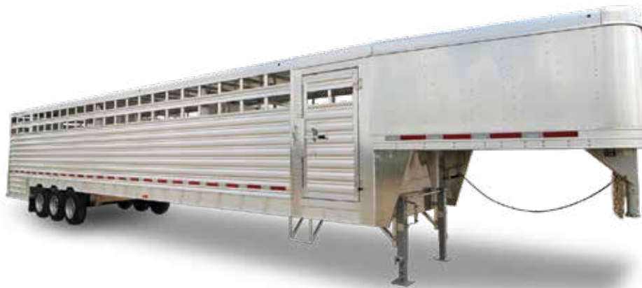
Shown: 40' with optional steps, steel wheels and grab handles.