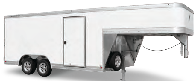
Model 1641. A versatile hauling option for your cars, ATVs, motorcycles, household items and much more! The trailer features a convenient rear ramp with cable assist and a durable 3/4" plywood floor.