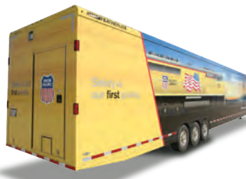
Classroom & training trailers. Go onsite for training & educational seminars.