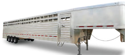
Model 8271. The 8271 features an expanded carrying capacity, similar to that of semi stock trailers, yet has the exceptional maneuverability of a gooseneck. The Model 8271 features a skid resistant extruded aluminum floor, triple axles and a radius roof rail.