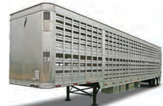
Model 8261. Model 8261 is a double deck livestock semi trailer that features heavy duty extruded aluminum top/bottom rail, aluminum treadplate floor and split escape doors.