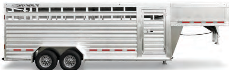
Model 8127. Gooseneck trailer Model 8127 is available in lengths ranging from 16' to 36' and comes with Featherlite's durable all-aluminum floor. Choose from an almost endless list of customization options. 7', 7'6" or 8' wide.