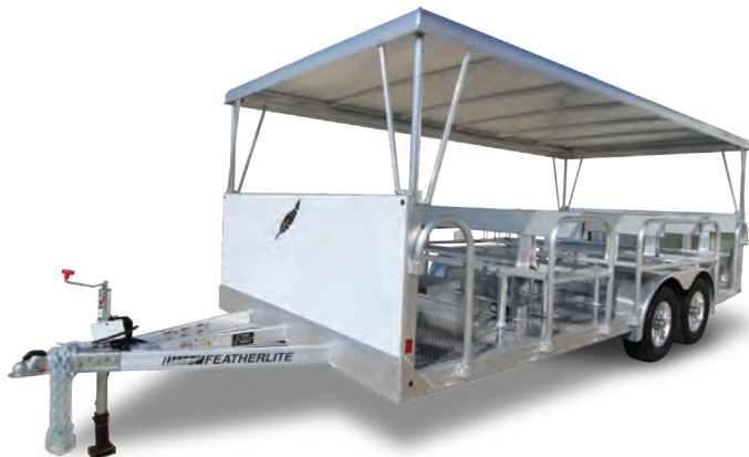
Model 3115 Tram. 3115 passenger tram is suited for transporting approximately 30 people; great for parks & tourist attractions.