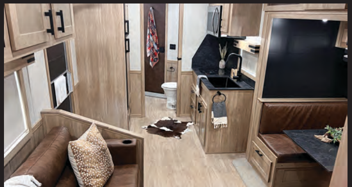
Urban Saddle Decor Package