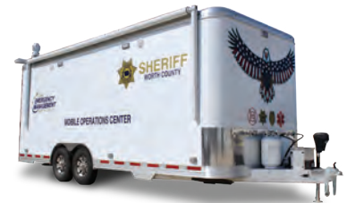
Mobile Operations Center. Options available in bumper pull, gooseneck or transporter.