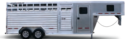
Model 8413 Combo. Versatile Model 8413 combo trailer is available with either straight or slant wall dressing room and in widths of 7', 7'6" or 8". Haul cattle, horses and other livestock!