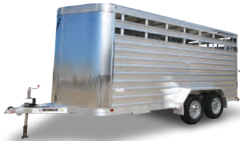
Model 8107. Bumper pull stock trailer with aerodyne nose features a gravel guard standard. Available in heights of 6'6", 7'0" or low profile 5'3". Length options include 12', 16' or 20'.