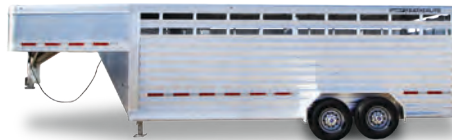
Model 8117. Model 8117 livestock trailer is a great value and option for your livestock hauling. It is available in 16', 20' and 24' lengths and is 6'7" wide. It has an aluminum floor standard with a full-swing rear gate with lockable slider.