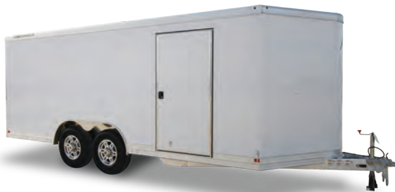
Model 1611. Recreation trailer Model 1611 measures 7' or 8'6" wide for versatile hauling of all types of recreational vehicles & equipment.