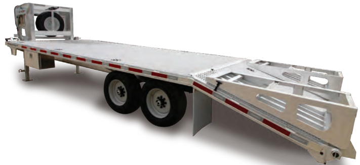
Model 1586 Flatbed. Aluminum flatbed Model 1586 is equipped with a 2" rub rail with stake pockets on 24" centers, wood flooring and L.E.D. lights. It comes with 7K axles. Options include beaver tail, ramps and toolboxes. Trailer is available in lengths up to 26' and with optional 8K axles.