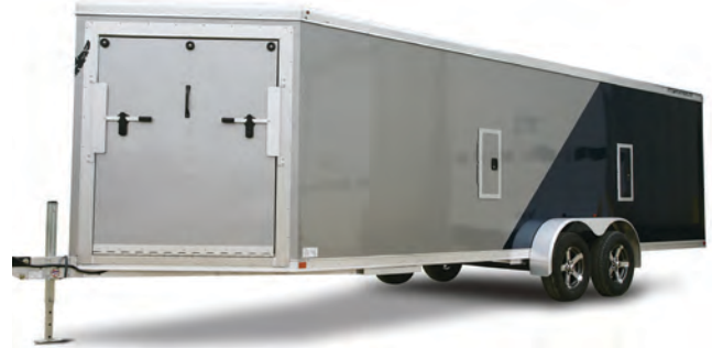
Model 1610V. The v-nose of Model 1610V not only offers an aerodynamic advantage but an unloading advantage too with its 50" front ramp. Choose from lengths of 12', 14', 16', 20' or 24'. Featherlite Advantage 23/32" wood floor comes standard. Shown with options including dual color side sheets.