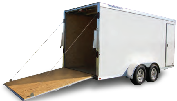
Model 1610 Utility. Features premium Featherlite Advantage wood flooring to better protect your cargo and the trailer's interior. Trailer features standard camper door and rear ramp.