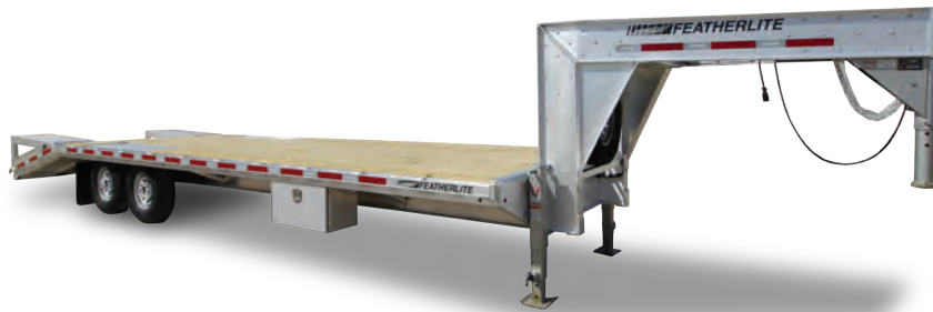
Model 1585 Flatbed. Flatbed trailer Model 1585 is versatile for hauling many types of equipment. Trailer shown with optional hydraulic brakes with battery package and aluminum wheels.