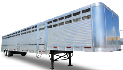
Model 8270. Semi stock trailer Model 8270 has corrugated aluminum treadplate floor and ramp behind rear center partition. Base lengths from 34 ft. to 53 ft.