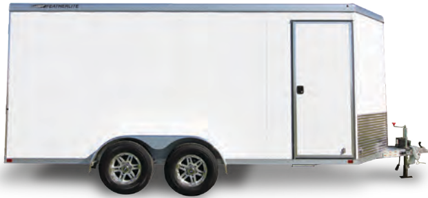
Model 1610. Recreation trailer Model 1610 features premium Featherlite Advantage wood flooring to better protect your cargo and the trailer's interior. An expanded selection of options, lengths and heights are available.