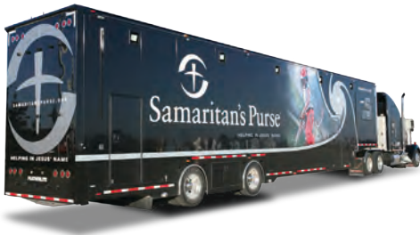
Mobile Disaster Response. Relief organizations can respond quickly to disasters.