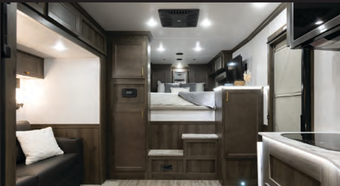
Glacier Ash Decor Package

Available in Model 9807 and 9808 Living Quarters.