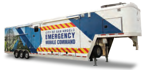
Mobile Command Center. Mobile response unit.