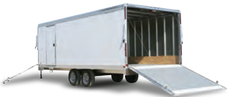
Model 1648 Snowmobile. Model 1648 snowmobile trailer boasts a rear ramp with cable assist and a front ramp and raised platform to make loading and unloading easier. The length ranges from 12' to 24'.