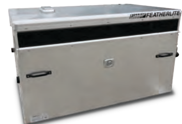
Model 8191. Model 8191 livestock box is 41" tall, 3'6" wide and is available in lengths of 6' or 7'6".