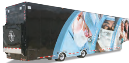
Mobile Medical Trailer. On site medical, research or response unit.