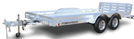
Model 1693. Open utility/rec trailer Model 1693 with rear ramp comes in 10', 12' or 14' lengths and is available with optional side ramp & side kit. Single axle 3500# 14' long model now available.