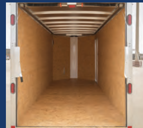
Featherlite Advantage Wall Lining