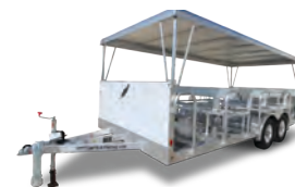
Model 3115 Passenger tram with benches

For more information on the Featherlite Full Line of Trailers, visit www.fthr.com