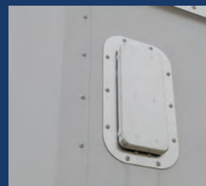
Streetside Air Vent