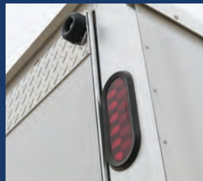
LED Exterior Lights