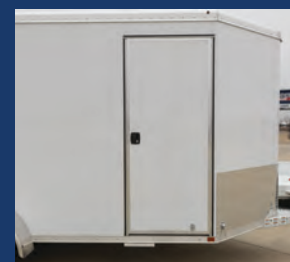
32" Side Door