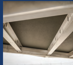
Aluminum Frame, Rails & Side Sheets