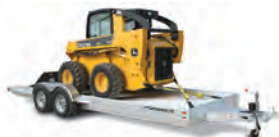
Model 3110 Open car hauler versatile for also hauling ATVs and skid loaders