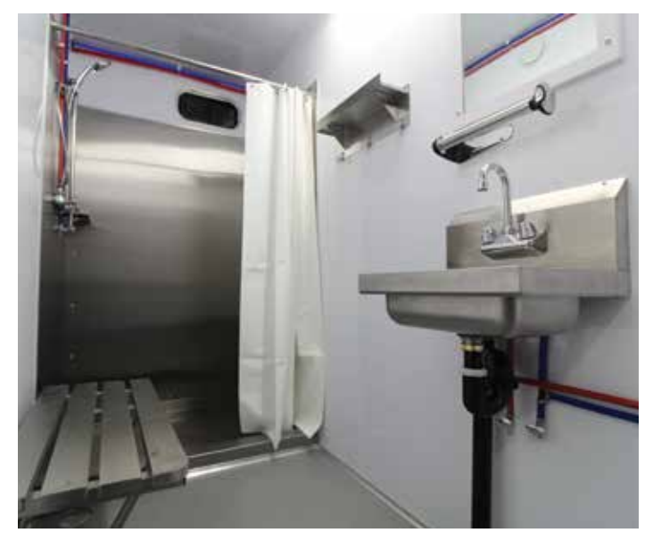
Self-containing trailers can include showers