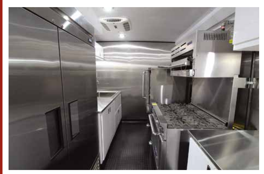
Kitchens allow officials to remain on the scene of a disaster for many days, serving staff, workers and community members