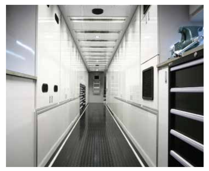
Unique storage options available