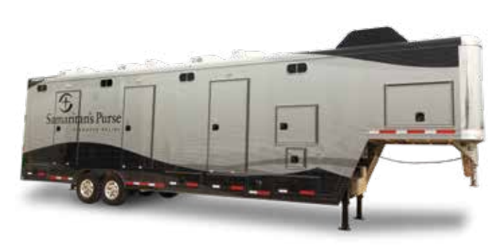
Mobile Shower Trailer