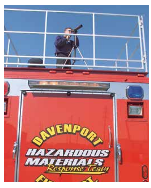
Observation decks offer additional space for assessing an emergency