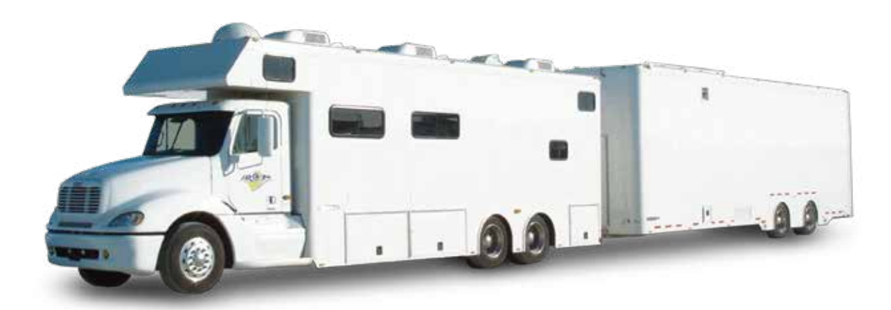
Custom Truck Body and Trailer