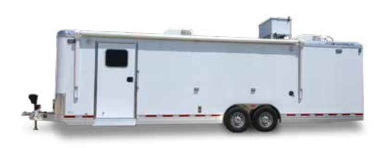
Mobile Police Command Center