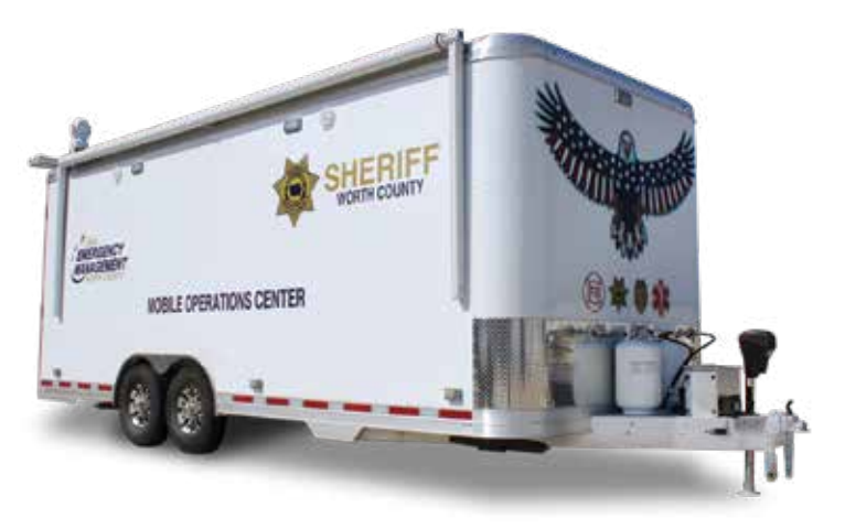
Mobile Operations Center