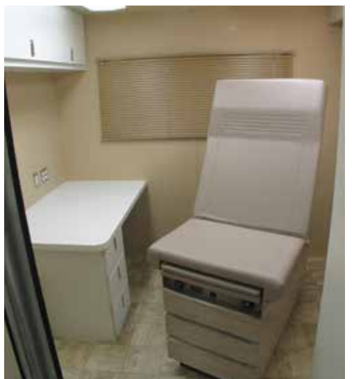
Exam room in a medical clinic trailer that serves patients off-site