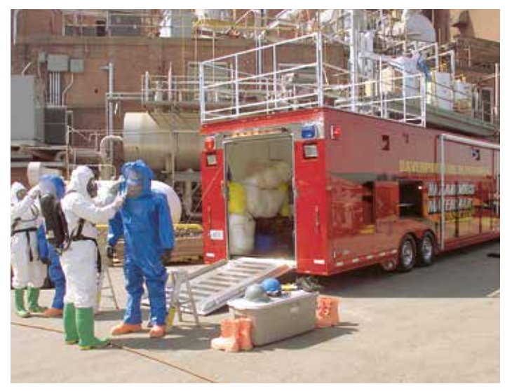
Mobile hazardous materials units allow the storage of all necessary equipment so your team can respond quickly