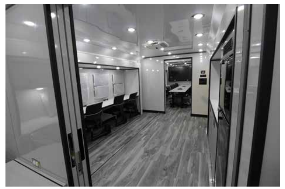
Communications/control centers are customizable inside command centers