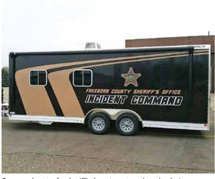
Command center for sheriff's department used on site during response situations.