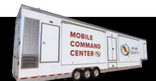
Mobile Command Center

power to arrive on scene at a moment's notice and remain until your work is finished.