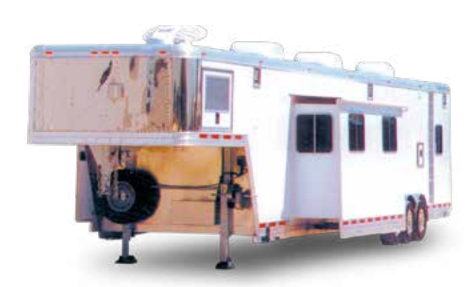
Animal Rabies Control