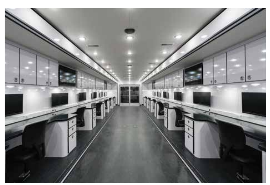
Mobile offices permit officials to work on site at a disaster