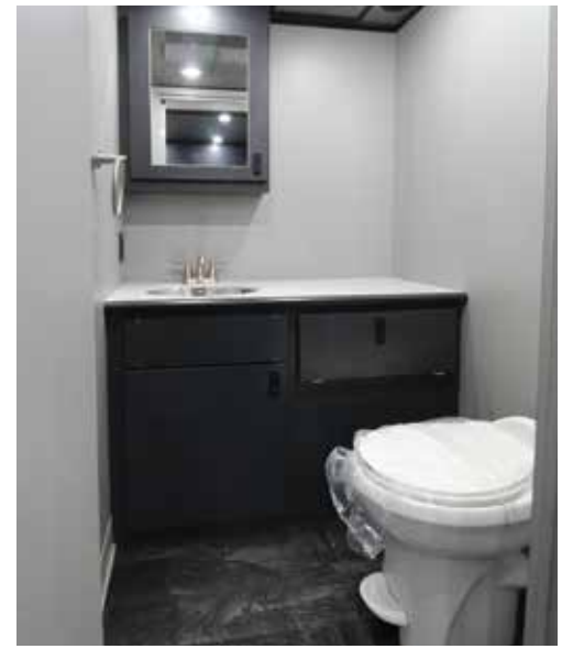
Restrooms of all kinds available