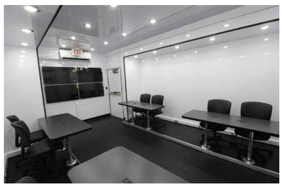
Various office or workstation configurations are available to suit your needs