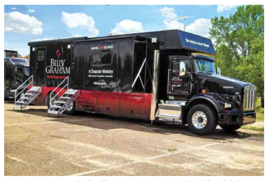
Disaster response or van bodies allow organizations to respond quickly and deploy volunteers in times of disasters