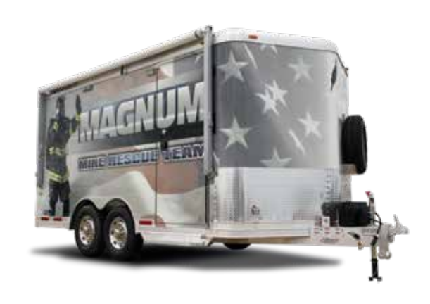
Mobile Mine Rescue Unit