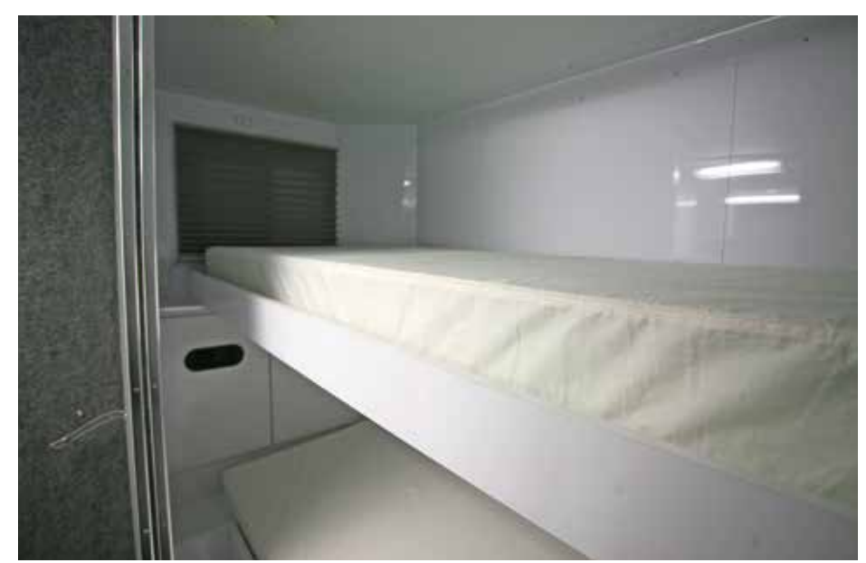
Bunk beds and other sleeping options available