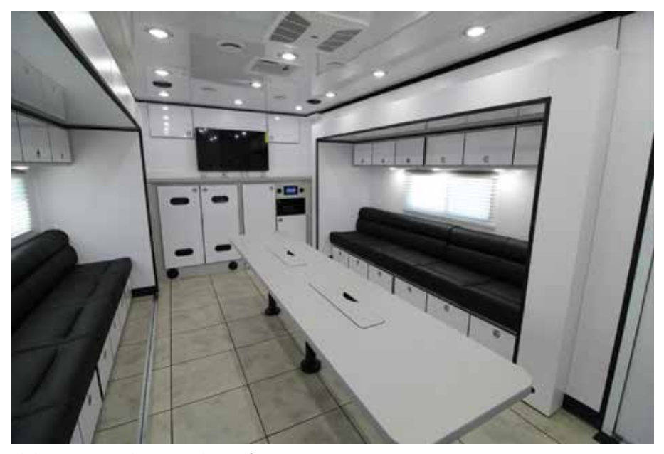
Slideouts expand your work or office space