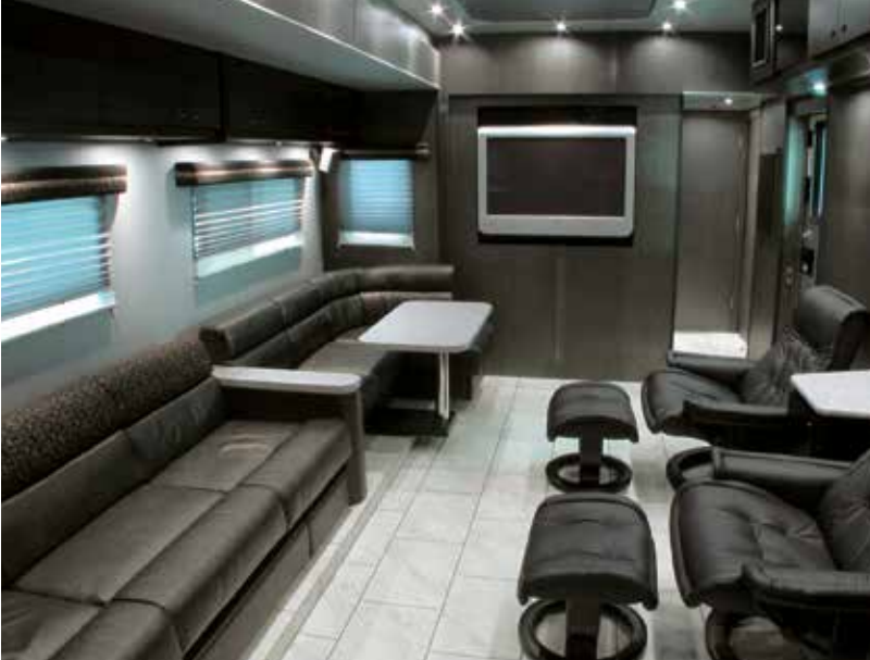
Emergency response trailers with living or hospitality space let officials remain on site for days and weeks if necessary.