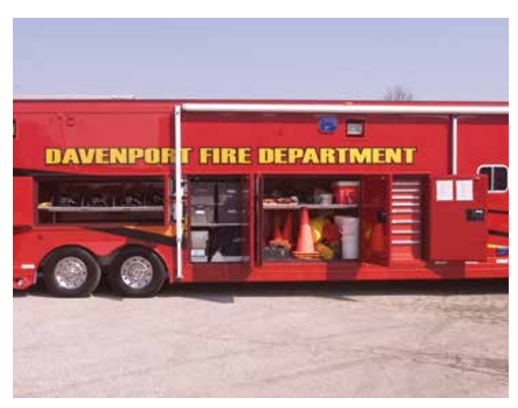
Large storage capacity accommodates all the necessary equipment on site