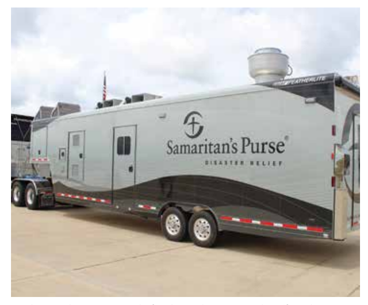
Kitchen trailers can provide food to volunteers and staff on the scene of disasters or emergencies.