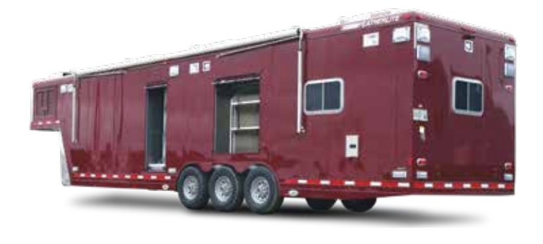
Mobile HazMat Response