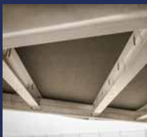
Juminum Frame Rails & Side Sheet