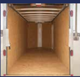
Featherlite Advantage Wall Lining