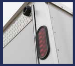
LED Exterior Lights