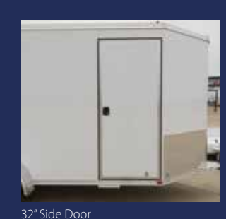
*Standard features vary by mode