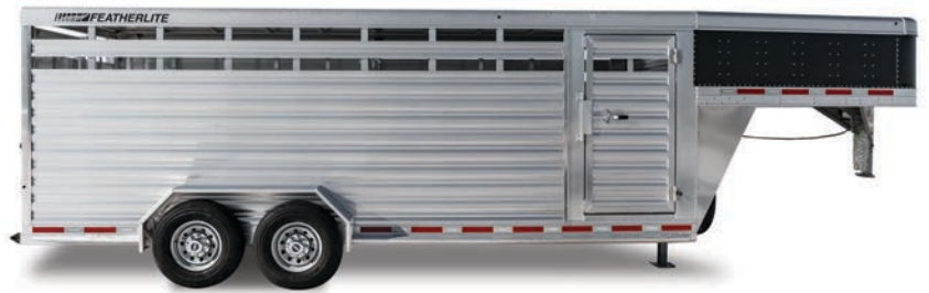
Shown: 20' model shown with optional black sheets.