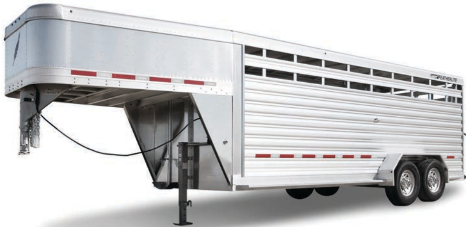
Shown: 20' model.