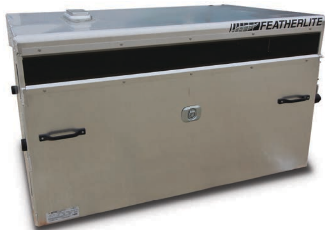
Shown: 6' model.