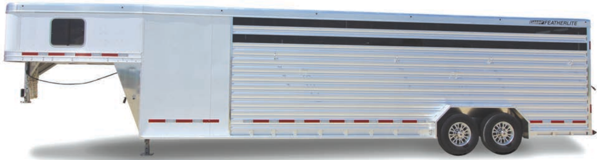
Shown: 28' model with plexiglass.