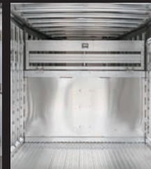
Brawny drop gate standard