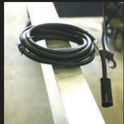
Wiring harness keeps wiring secure