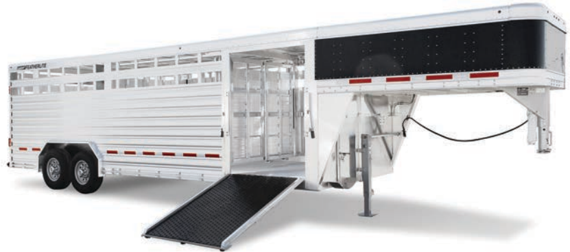
Shown: 24' model with optional black side sheets and side ramp.