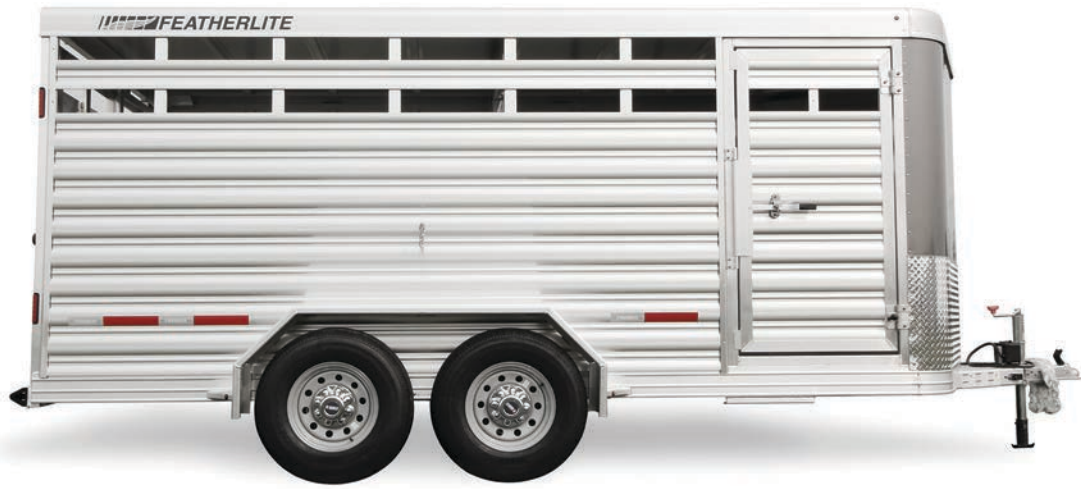
16' model with optional charcoal side sheets.