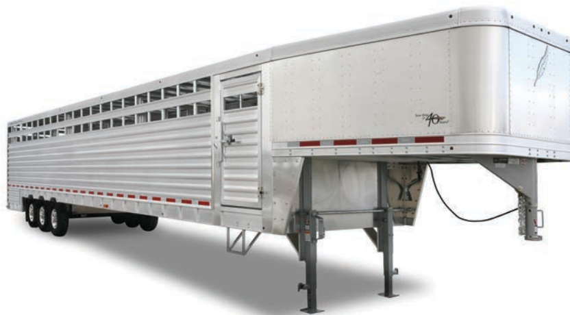
Shown: 40' with optional steps and additional lights.