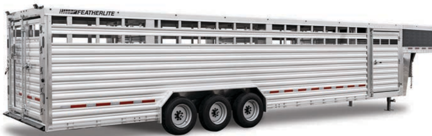
Shown: 34' model with 54" escape door, black sides sheets and more.