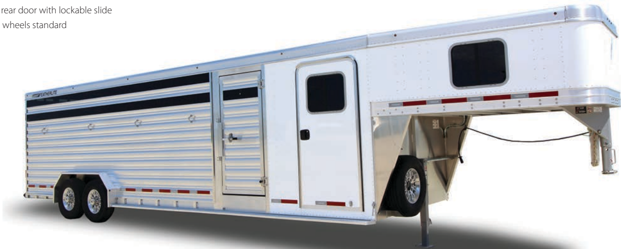
Shown: 28' model with plexiglass.

Dimensions shown are approximate and may vary.