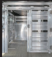
Optional Step Safe gates protect livestock