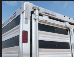
Heavy-duty rear hardware