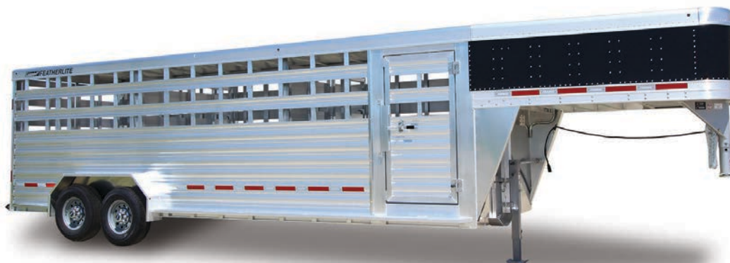
Three top air spaces are optional on your stock trailer.