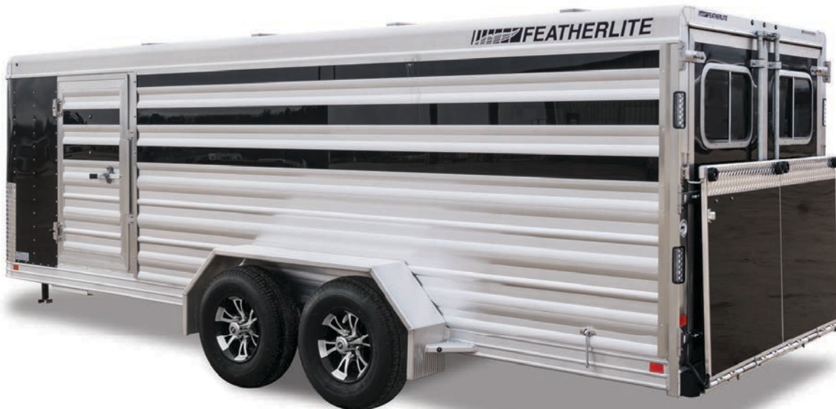
Shown: 16' low profile with plexiglass, rear ramp, black side sheets and other options.