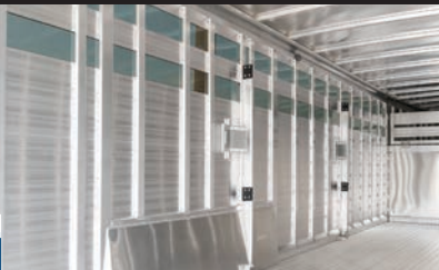
Side panels with smooth interior wall