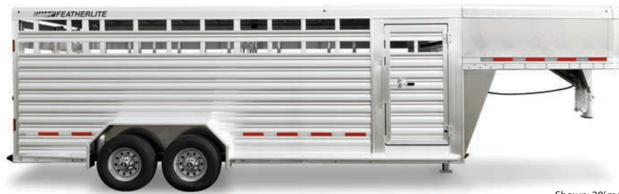
Shown: 20' model.