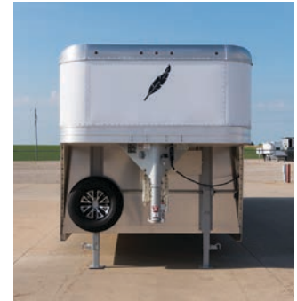
Gooseneck tapered nose