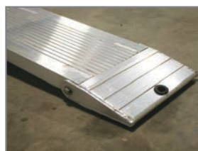
Flex Foot ramps