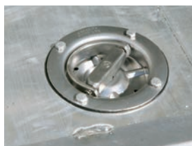
D ring tie downs