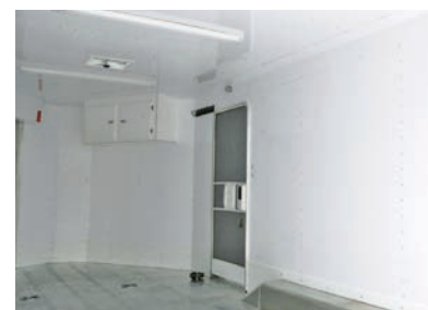
White lined & insulated interior

Note: All dimensions are approximate. Some trailers may be shown with options.