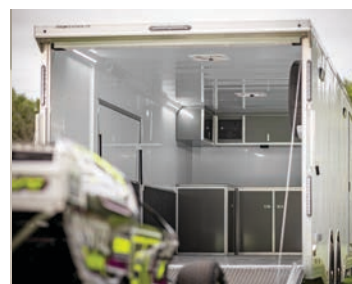
Wide array of cabinet options