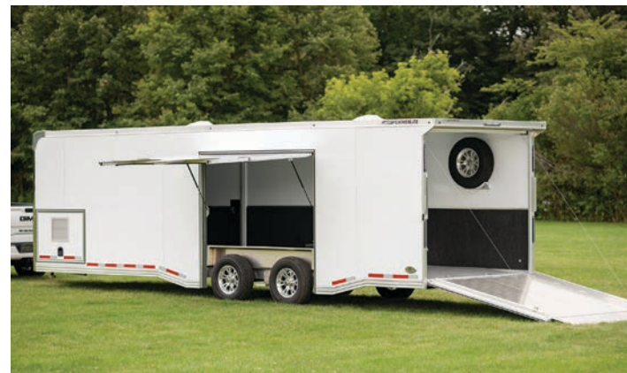
Premium escape door on 4410