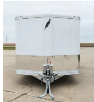
Bumper pull aerodyne nose

Features may vary depending on trailer model. Some options shown are not available on all models.