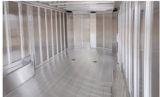
All aluminum construction