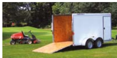
Featherlite utility trailers also serve a variety of hauling needs for contractors, landscapers and other business owners.