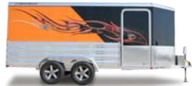
Model 1610 shown with optional polished panels, dual sides, graphics and aluminum wheels.