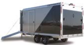
Model 1648 shown with dual side sheets, aluminum wheels and load lights.