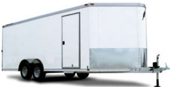
Trailers may be shown with options.